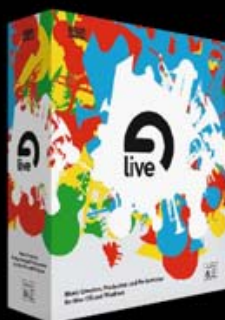
Ableton Live 6 LE