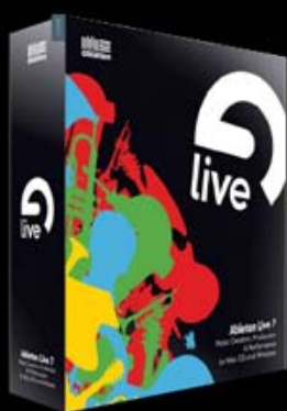
Ableton Live 7