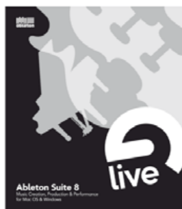
Ableton Suite 8