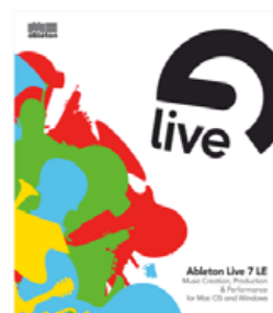
Ableton Live 7 LE