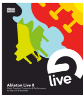
Ableton Live 8